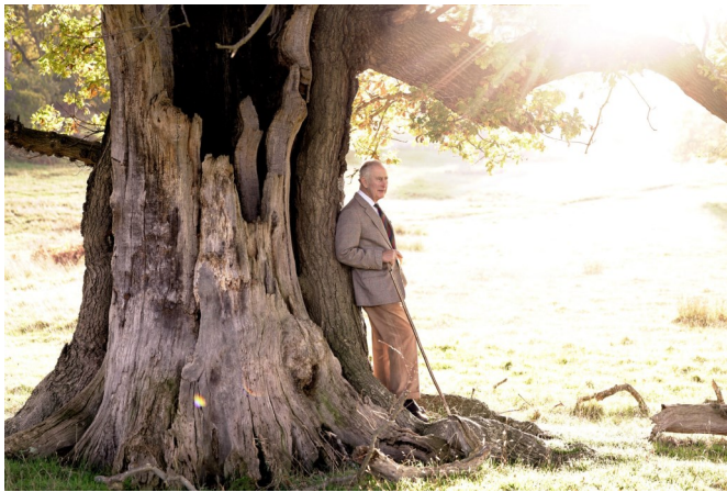
King Charles III, The Ranger of Windsor Great Park